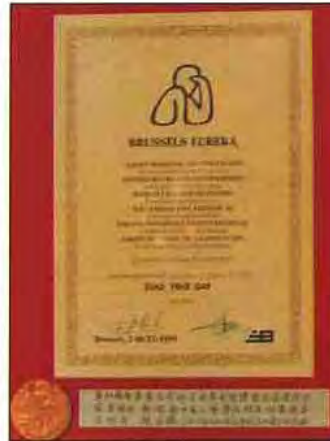
尤裏卡金獎證書 BRUSSELS EUREKA gold medal