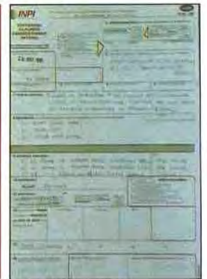
歐洲16國發明專利 Europe patent