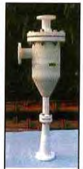
整體F4噴射泵 PTFE jet pump