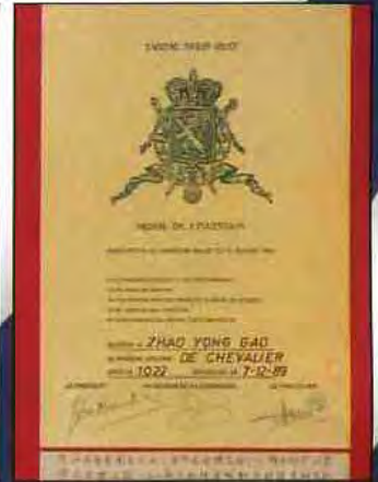
尤裏卡騎士勳章證書 BRUSSELS EUREKA knight medal