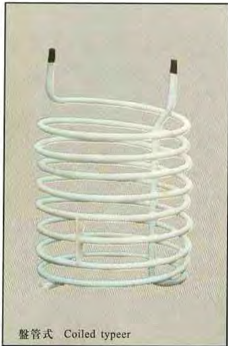
盤管式 Coiled type