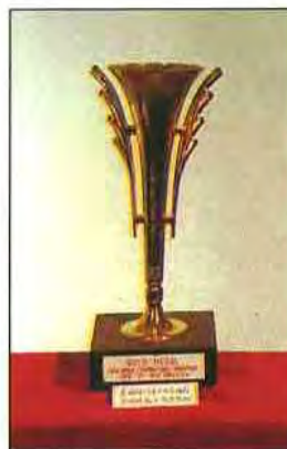
紐約國際發明金質獎杯 NEW YORK international gold medal