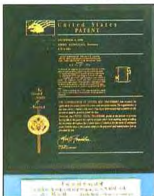
美國發明專利證書 United States patent