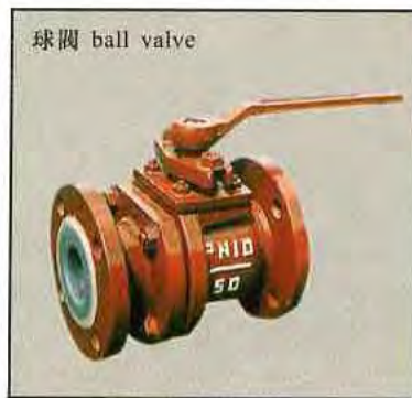
球閥 ball valve