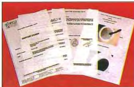
法國國家實驗室試驗報告 France national laboratory report