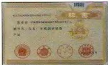
國家級新產品證書 National new product