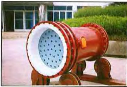
管殼式 shell-tube type