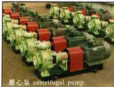
離心泵 centrifugal pump