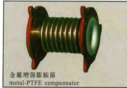
金屬增強膨脹節 metal-PTFE compensator