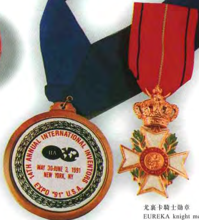
紐約國際金質獎章 NEW YORK internat. Gold medal