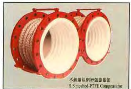
不銹鋼絲網增強膨脹節 S.S.meshed-PTFE Compensator