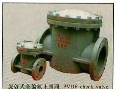
旋啟式全偏氟止回閥 PVDF check valve