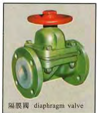
隔膜閥 diaphragm valve