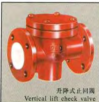
升降式止回閥 Vertical lift check valve