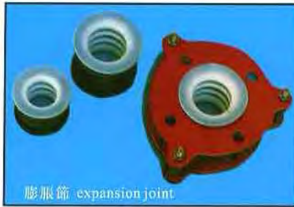
膨脹節 expansion joint