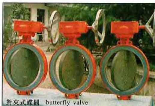
對夾式蝶閥 butterfly valve