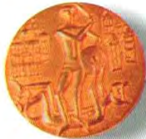
尤裏卡金質獎章 EUREKA gold medal