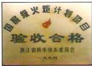
國家級火炬計劃項目 驗收合格證 National "Torch-Plan Item" 浙江省科學技術委員會 一九九四