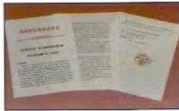
國家科委向全國推薦產品文件 Papers of National science Comm