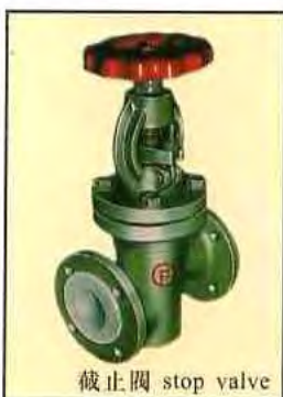
截止閥 stop valve